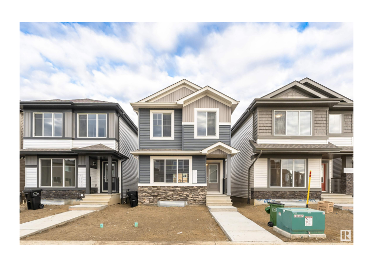
9566 Carson Bnd SW, Edmonton, AB Main Floor Exterior Area 65.12 m²

Main Floor Exterior Area 65.12 Interior Area 59.37 r